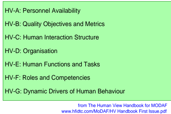
Figure 3: Human Views for MODAF

The different divisions of defense are working on the human factors, see for instance the navy document [5]. Figure 2 shows the Navy perspective.