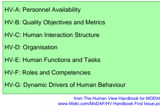
Figure 3: Human Views for MODAF

instance the navy document [5]. Figure 2 shows the Navy perspective.